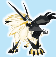
•Dusk Mane Necrozma